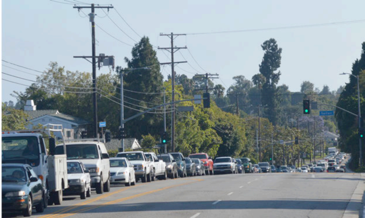
Green light but nowhere to go: Sunset traffic extends beyond Kenter Ave. on typical weekday afternoons.